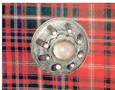
The Brooch of Lorn

Help us to preserve your ancient heritage by becoming a member of the Clan MacDougall Society. Membership information is available at http://macdougall.org/membership-information/